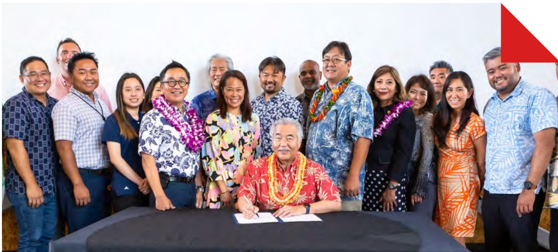
Governor Ige signing the Hawaii State Legislative bill SB2808 for funding appropriation of $500,000 to support the State Small Business Credit Initiative Program (SSBCI)

For more information: www.htdc.org/hicap